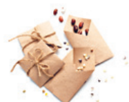
Herb seeds such as basil or thyme