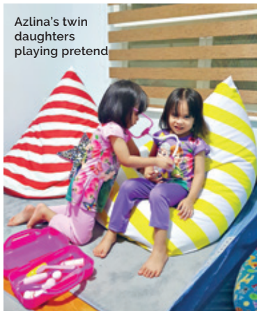
Azlina's twin daughters playing pretend

My twins are active and adventurous so I have created fun and safe play spaces for them indoors. It's a space where they can feel a sense of belonging with their artwork and photographs on display. I provide spaces for pretend play, physical play, reading and relaxation. I use these opportunities to encourage play and cultivate good habits such as sharing toys and tidying up after playing.