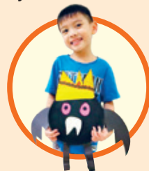
TEW HENG KAI , 5

We showed you how to make a Halloween-inspired craft in the Oct-Dec 2018 issue and here's what some of you have created!