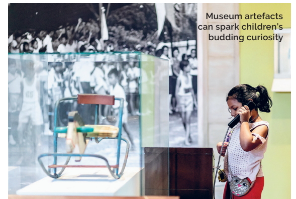
Museum artefacts can spark children's budding curiosity

Singapore's pandemic experience is presented through photographs, films, artefacts and stories. Use the 'Family Guide' to talk to children about the exhibits. It is a good way to engage them on contemporary issues related to Singapore.