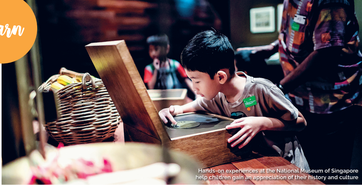
Hands-on experiences at the National Museum of Singapore help children gain an appreciation of their history and culture