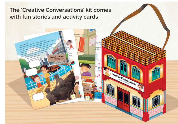
The 'Creative Conversations' kit comes with fun stories and activity cards

Besides the kit, other NMS resources also present artefacts in formats familiar to young children. Examples include