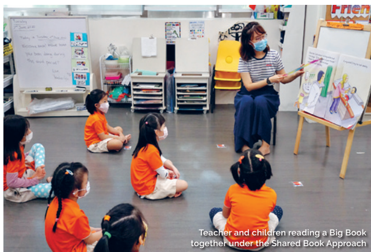
Teacher and children reading a Big Book together under the Shared Book Approach

MY FIRST SKOOL @ SEMBAWANG SHOPPING CENTRE EXAMINED HOW SHARED READING BUILDS LINGUISTIC COMPETENCIES AND SELF-CONFIDENCE IN CHILDREN.