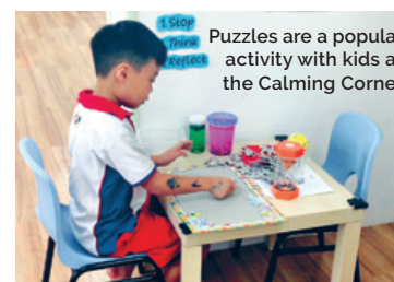
Puzzles are a popular activity with kids at the Calming Corner

A Calming Corner was set up for Kindergarten and N2 children, where they were given a choice of activities to redirect their attention before they felt ready to return to class. The space was equipped