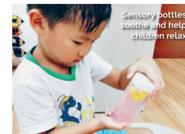
Sensory bottles soothe and help children relax