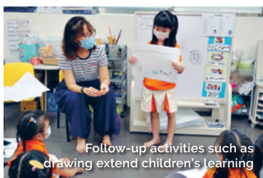
Follow-up activities such as drawing extend children's learning

SBA is an interactive reading experience where teachers facilitate the reading process, which includes discussions about the cover and title, making predictions and retelling the story. "It is a platform where children can enjoy reading and build literacy skills through fun and meaningful activities. Improving their language ability also helps boost