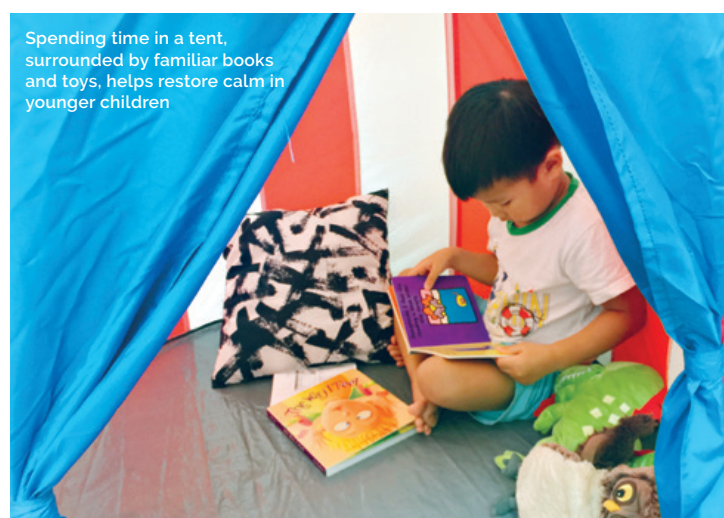
Spending time in a tent, surrounded by familiar books and toys, helps restore calm in younger children