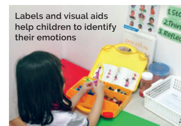
Labels and visual aids help children to identify their emotions

with sensory play items such as building blocks, puzzles, stress balls and sensory bottles. Display labels were there to remind children to "Stop, Think, Reflect" and identify their emotions. Visual aids also provided ideas on what else they could do to calm down, such as drinking water or writing about what had happened. For toddlers and N1 children, play mats and tents provided them with their own safe, predictable spaces surrounded by their toys, and this helped them to calm down.