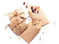
Herb seeds such as basil or thyme