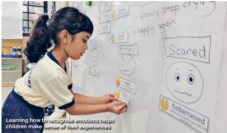
Learning how to recognise emotions helps children make sense of their experiences