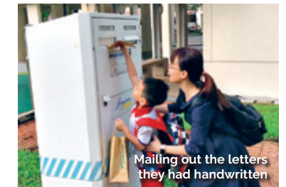
Mailing out the letters they had handwritten