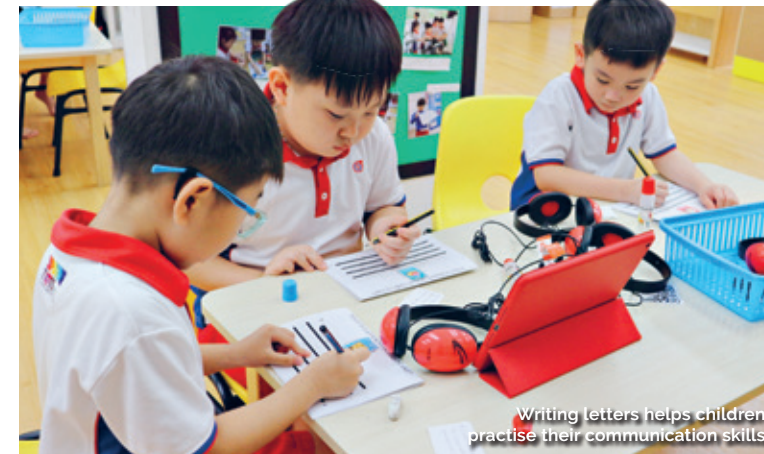
Writing letters helps children practise their communication skills

CHILDREN DISCOVER A SENSE OF BELONGING THROUGH LETTER WRITING.