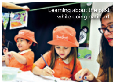
Learning about the past while doing batik art

A record 49,000 children from 820 preschools are taking part in this year's movement. Among them is CitiKids Academy, which has