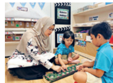
MOE Kindergarten @ Sengkang Green encourages interaction among children to promote MTL learning