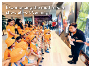
Experiencing the multimedia show at Fort Canning