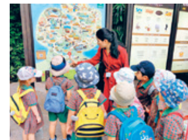
Teachers at EtonHouse Zhonghua Pre-School use MTL during field trips to allow language learning to take place naturally