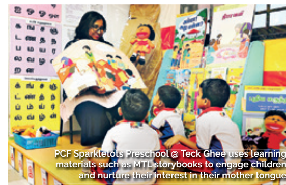
PCF Sparkletots Preschool @ Teck Ghee uses learning materials such as MTL storybooks to engage children and nurture their interest in their mother tongue

HOW THREE PRESCHOOLS NURTURE CHILDREN'S INTEREST AND LOVE FOR THEIR MOTHER TONGUES.