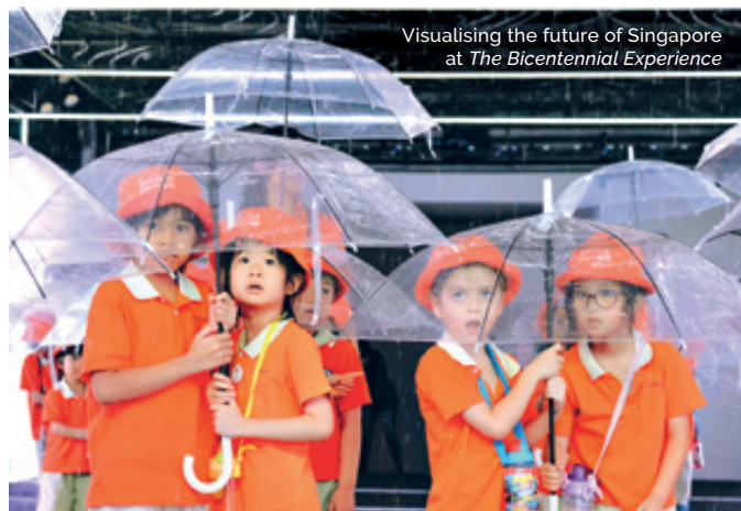
Visualising the future of Singapore at The Bicentennial Experience