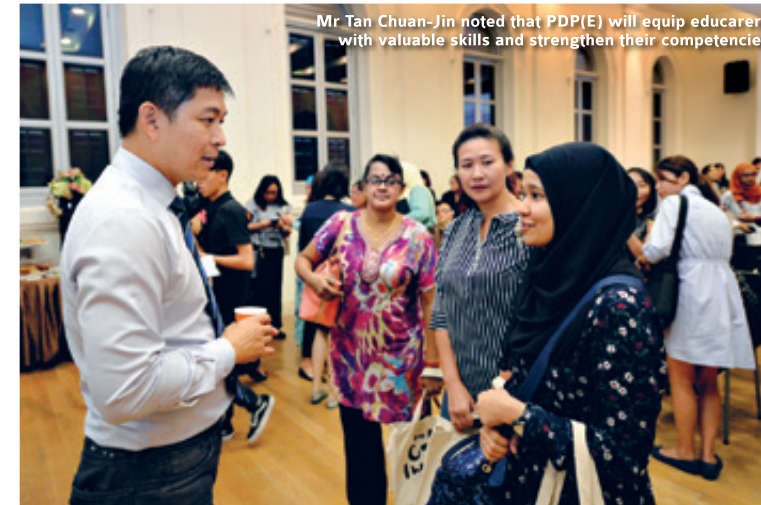
Mr Tan Chuan-Jin noted that PDP(E) will equip educarers with valuable skills and strengthen their competencies

THE FIRST BATCH OF PARTICIPANTS FROM THE PROFESSIONAL DEVELOPMENT PROGRAMME FOR EDUCARERS HAS BEEN OFFICIALLY APPOINTED.