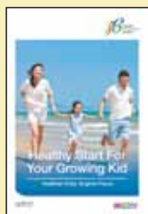
'Healthier Child, Brighter Future'