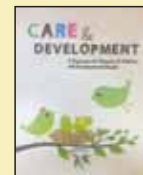
'Care & Development' Resource Kit