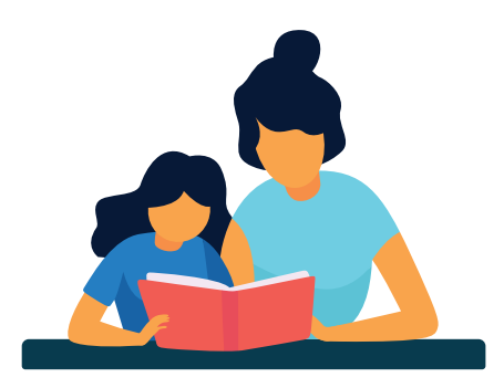
Parents More varied needs and rising expectations

Changing demographics such as dual-income families, working grandparents